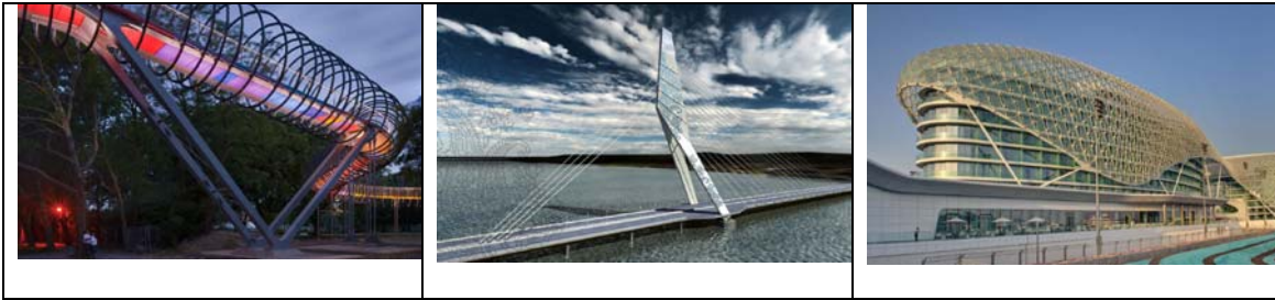
Sample Structures by Schlaich Bergermann and Partners